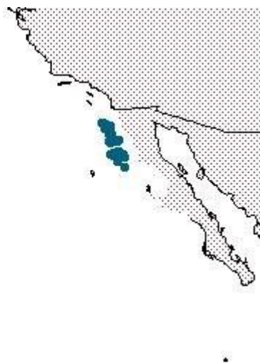
Figure 1. Fishing area for PBF in Baja California, Mexico in 2018

In figure 1 the location of all the effort for 2018 fishing season is presented. The area is located in the northern part of Baja California peninsula where in recent years all the fishing activities are situated for logistical reasons.