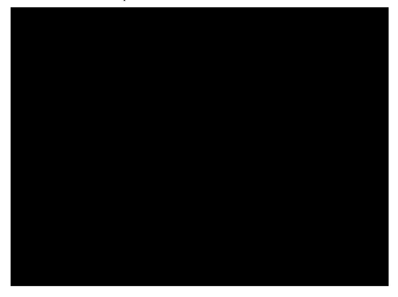
Table 1. Details for set up, release, pop-up from 27 PSATs deployed on striped marlin, black marlin and blue marlin PTT: platform transmitter terminal.