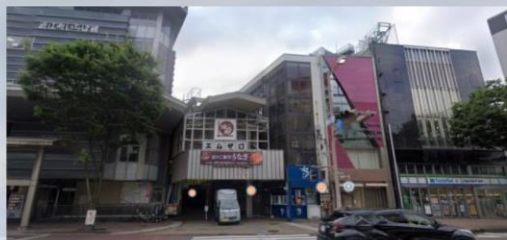
③ Entrance of the Market